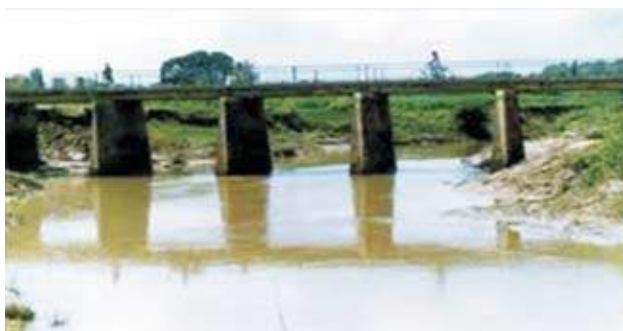
Bridging the Gap

Rural areas would have a high concentration of poverty given the existence of disguised unemployment in a big way in agriculture. Access to land and ownership of land is the key to income differences since land is the major productive asset in rural areas. Rural areas may be more usefully viewed as concentration of poor resulting in little value for economic demand for infrastructural services. The fact remains that state interventions, despite their large scale of operations, never aimed at any basic structural changes in the agrarian society. What could have been the simplest and most effective way i.e. through land reform to eliminate poverty was never pursued despite the rhetoric. Governance and infrastructure are secondary to endowments. But without endowments, good governance is a contradiction in terms. The numerous programmes or schemes that included massive interventions such as the Integrated Rural Development Programme (IRDP), Mini-mum Needs Programme (MNP), and Public Distribution System (PDS) etc.