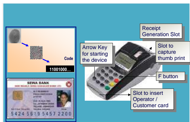
Figure I- Smart Card (Technology from Financial Inclusion Network & Operations Ltd.)