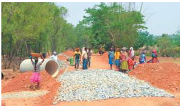
Fastening the Growth

Infrastructure is important for the services it provides. It is an important input to the production process and raises the productivity of other sectors. Infrastructure connects goods to the markets, workers to industry, people to services and the poor in rural areas to urban growth centers. Infrastructure lowers costs, enlarges markets and facilitates trade. Thus, infrastructure provides services that support economic growth