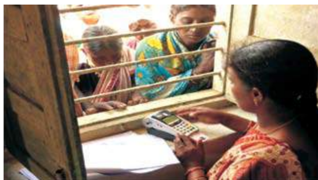
Figure II - Use of Smart Card