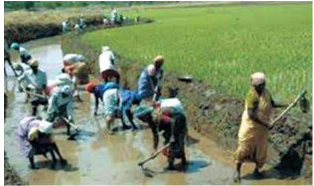
NREGP- A Poverty Eradication Tool

rural infrastructure. Plans proposed for the development of India Rural Infrastructure are -